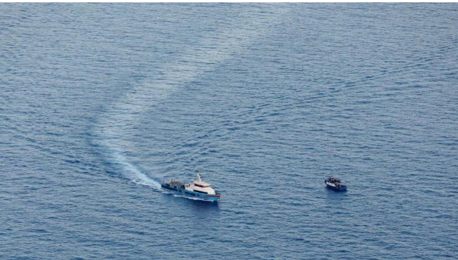
Interception of ~250 people in distress by a Haftar's Tariq Ben Zayed militia vessel in July 2023.

We reported in our last issue in the context of an article on SAR 3 on the appearance of a new push back actor in Benghazi, a militia called Tareq Bin Zayed Brigade. During their operations in the last weeks they not only towed a vessel with 500 people from the middle of the Maltese SAR back to Libya, but even carried out the abduction of 110 people from a boat that had started in Lebanon and never touched the Libyan SAR. These interceptions obviously took place in strong collaboration with authorities in Italy, Malta and the EU (Frontex) , who do not by any means omit the chance to stop refugees and migrants from reaching European shores. The brigade is under the control of Haftar, a strongman in eastern Libya, who was welcomed by Meloni in Rome in May 2023.