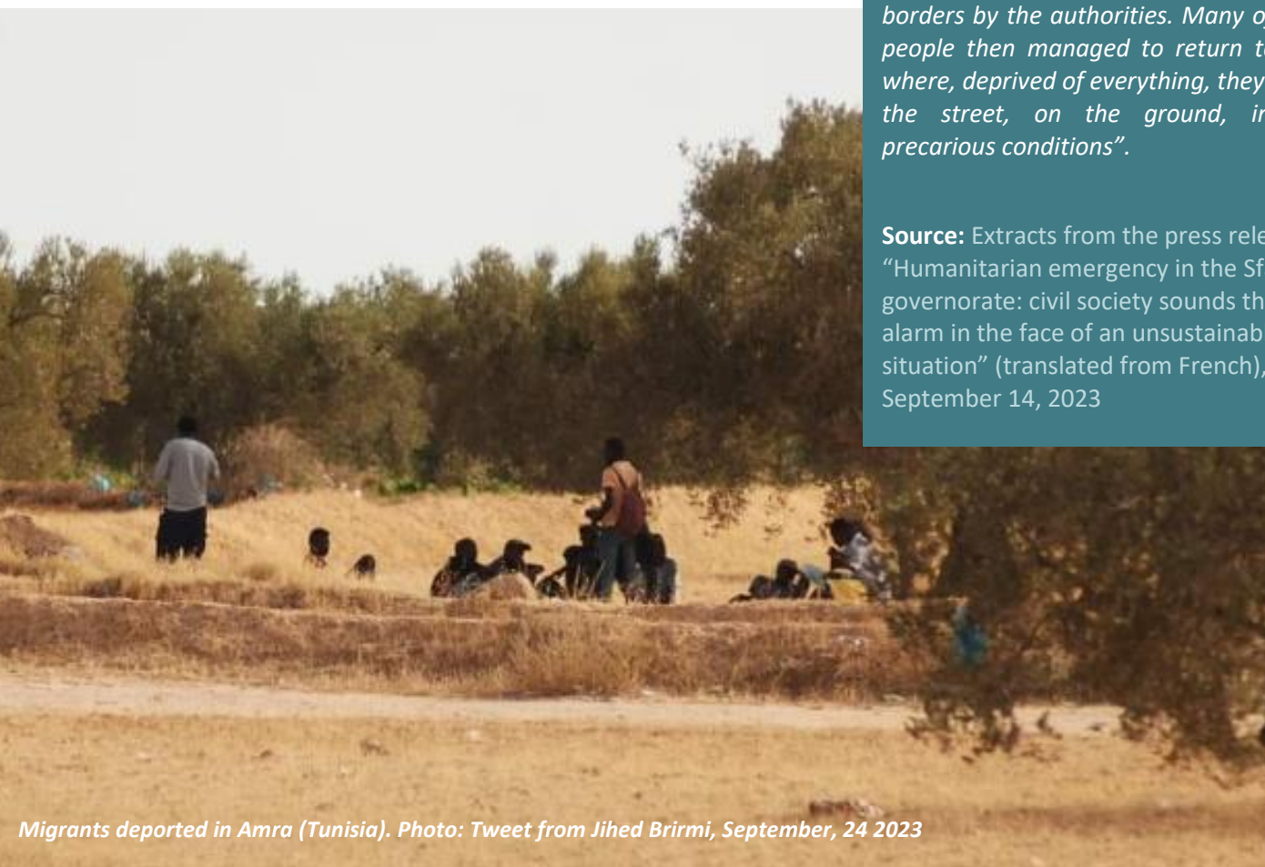
Migrants deported in Amra (Tunisia).

Source: Extracts from the press release "Humanitarian emergency in the Sfax governorate: civil society sounds the alarm in the face of an unsustainable situation" (translated from French), September 14, 2023