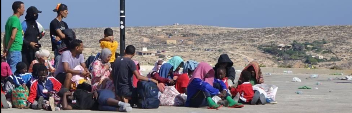
People on the move arrived in Lampedusa, September 2023.