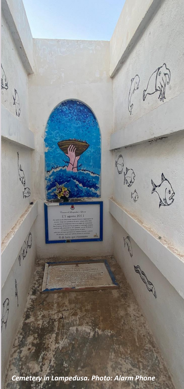
Cemetery in Lampedusa.

However, a complementary solution to the plans for a forensic system capable of better and ideally