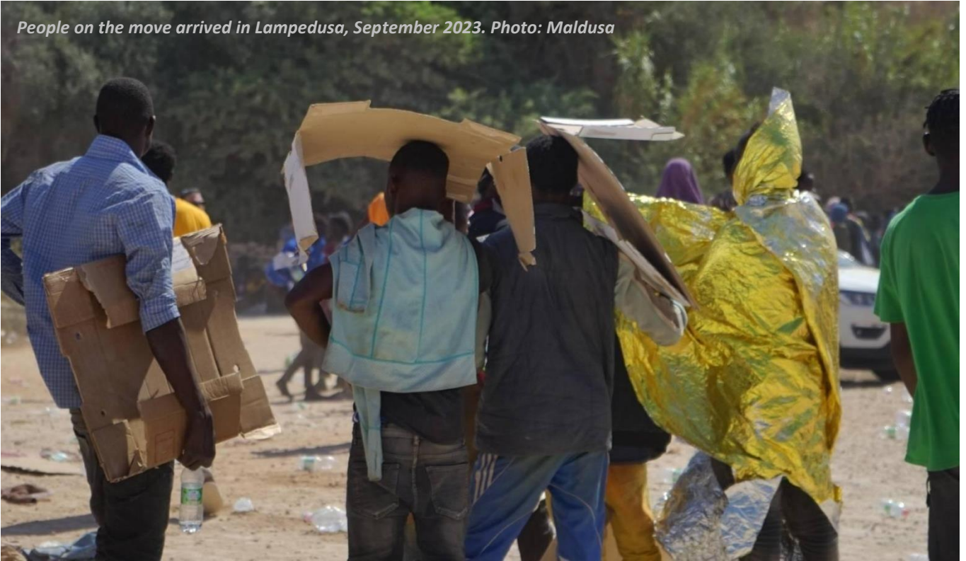
People on the move arrived in Lampedusa, September 2023.

The visit of Meloni and Von Der Leyen in Lampedusa on the 17th of September represented an abrupt return to an unacceptable normality. The door of the hotspot closed again, and 1,700 people remained confined inside overcrowded and dirty conditions. During the visit, a police cordon prevented migrants from approaching the main door, which had been pulled open for the authorities' parade. The long road to the hotspot was empty again, and its crossing was barred by the army. A similar transformation had taken place at the Favalaro pier, made presentable again after days of indecency and dehumanization, with hundreds of people forced to stay there for hours, with no access to food, sanitation, and proper medical care.