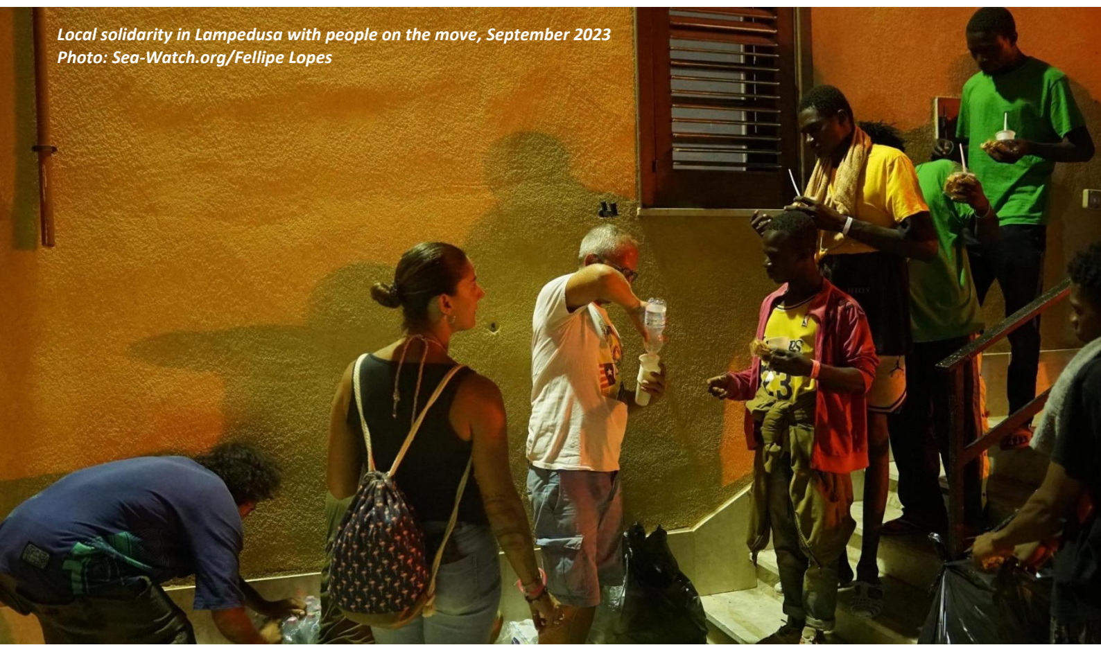
Local solidarity in Lampedusa with people on the move, September 2023

An example of this is the situation in Porto Empedocle (south of Sicily) where, faced with the dramatic inadequacy of the reception facility for people transferred from Lampedusa as a first stop, hundreds of people on the move rebelled and abandoned the facility, heading autonomously North. Similar cases are occurring all over Sicily (Caltanissetta, Pozzallo, etc.) and all over Italy.