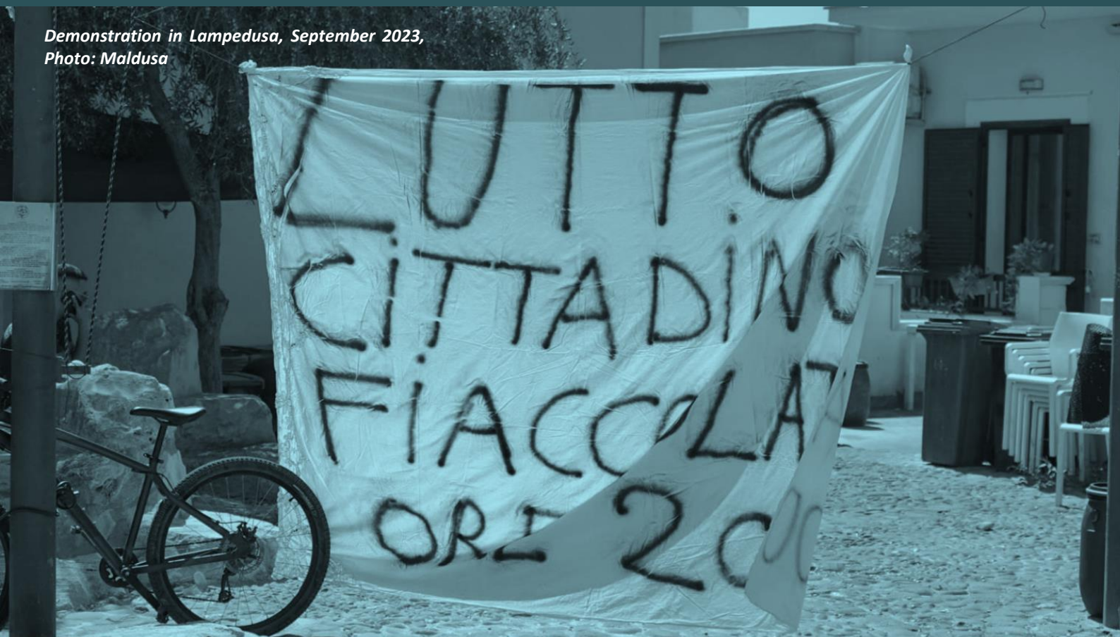
Demonstration in Lampedusa, September 2023

And we will keep standing by their side!