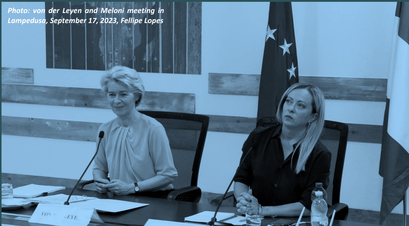
Photo: von der Leyen and Meloni meeting in Lampedusa, September 17, 2023, Felipe Lopes

For those who manage to overcome all these obstacles, by conquering the right to remain, the commissioner urged the other MSs to accept transfers of migrants from Italy, through the Voluntary Solidarity Mechanism (point 2). In the meantime, EU countries such as Germany and France declared their unavailability to receive migrants,