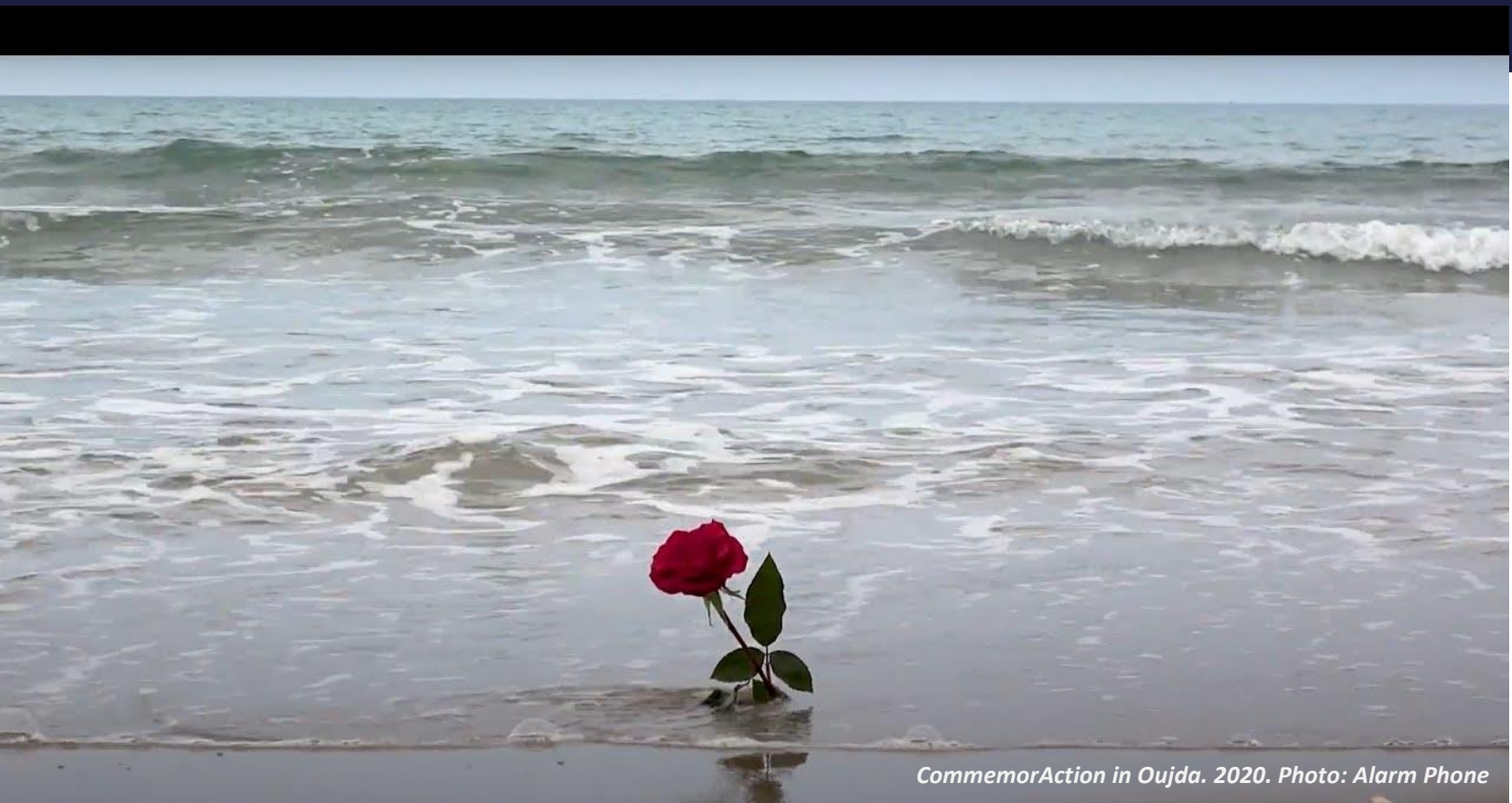
CommemorAction in Oujda. 2020.

That's it: wherever we want to remember the Lampedusa tragedy these days, on the island itself or anywhere else, it will be meaningless to do so unless we want to turn this sad anniversary into a starting point to radically change the policy conducted over the past five years toward migrants and refugees. The "last of the earth."