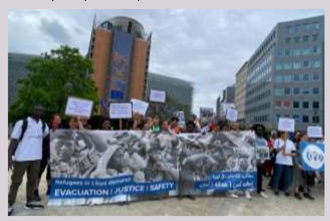
Picture: Solidarity with Refugees in Libya, Protest in Brussels, July 2023

The last day, 1st of July, started with the closing assembly in which the content of each workshop was summarized and concluded with a rally, joined by local movements of migrants and Sans Papiers. The demonstration with about 150 participants crossed the capital of the European Union, passing the headquarters of its institutions and the offices of the executors of the brutalization of migration policies: the Council of the EU, the Commission, Parliament, UNHCR, IOM, Frontex, ICMPD.