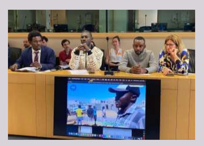
Picture: Solidarity with Refugees in Libya, Meeting with MEPs in European Parliament, July 2023