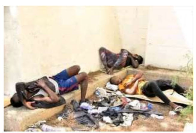
People arrested in Zarzis and deported to the desert.

Today, at 8:56 CEST, Alarm Phone received the following message from someone who had been deported into the desert by Tunisian forces: "We are not well. We were attacked by armed soldiers. The Libyan forces shot at us, beat us up, and raped the women during the night. I am running out of battery."