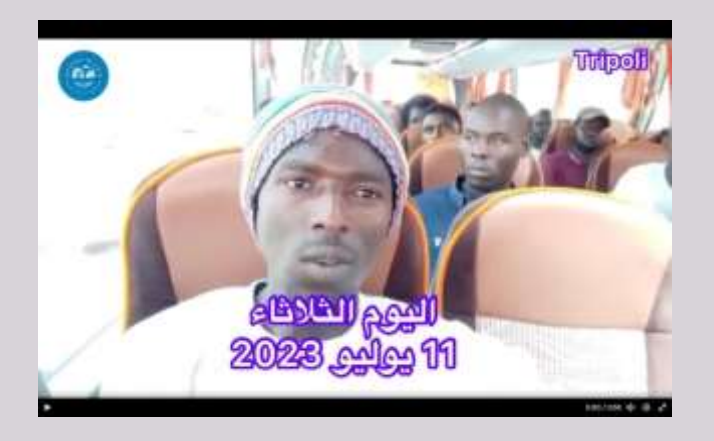
Picture: Video taken from the first bus of comrades from Refugees in Libya leaving Ain-Zara

On 30th of June, at the end of the counter-summit, the hoped-for news already arrived at the transnationally composed conference: Officials from UNHCR Libya had surprisingly visited the centre of Ain-Zara with an assessment on the detainees as a starting point for a release process. It was hard to believe, and at first it remained unclear, under which conditions the release should happen. But in the days after it became clear. Agreements have been signed, in which the conditions and methods of release were fixed: transfer to an urban area, financial assistance (in the form of cash and credit cards) for the accommodation and the purchase of non-food items, individual medical interventions based on specific needs.